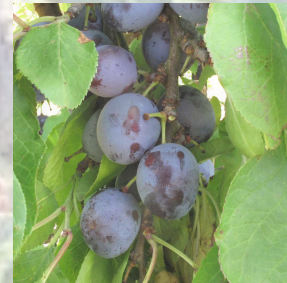
Early Rivers plum, Rivers cultivar 1834