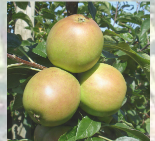
Thomas Rivers apple, Rivers cultivar 1897