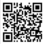
QR code for dedicated Rivers 300 website

300th Anniversary tree planting in the Orchard : 6 newly planted Rivers plum cultivars including Czar (see below)