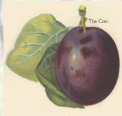
Czar Plum, Rivers Cultivar 1874