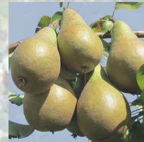
Conference pear, Rivers cultivar 1885