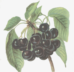
Watercolours of apples and cherries by May Rivers